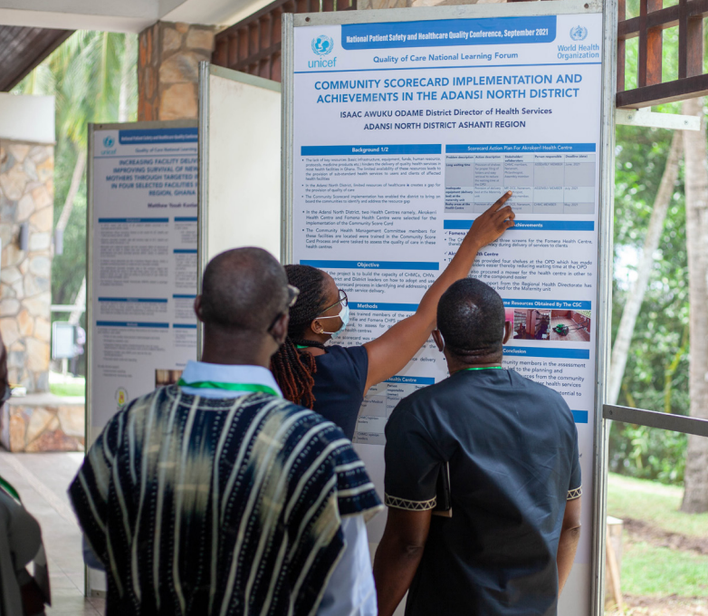
Adansi North District Director of Health making a poster presentation demonstrating the role of the district's implementation of Ghana's Community Score Card as a tool for resource mobilization for health facilities.