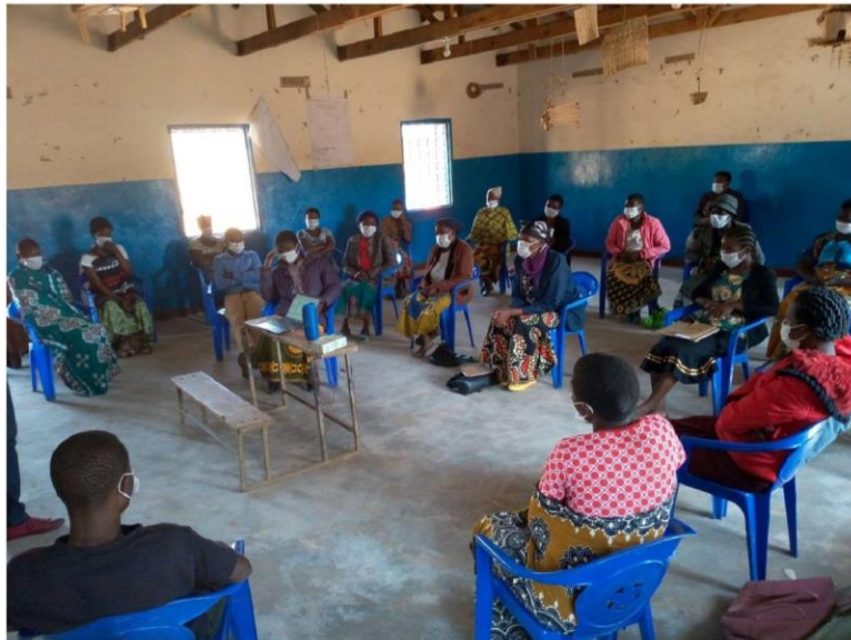
Picture 1: Pretest participants listening to radio messages. They quickly followed messages due to characters featured in messages and interest to start commenting earlier was sparked.

Below are pictures that share the whole story of the visit.