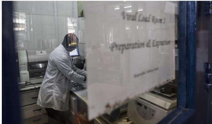
Health workers in Malawi's public hospitals reported severe shortages of personal protective equipment, prompting demands for more secure working conditions

Blantyre, Malawi - Dozens of health workers in Malawi's commercial capital, Blantyre, have staged a sit-in to protest against working conditions during the coronavirus pandemic , including a "critical" shortage of personal protective equipment (PPE) needed to treat patients.