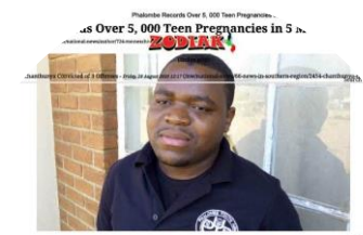
as Over 5,000 Teen Pregnancies in 5 Months

Lc. 19 G. 28 Aug. Gender a SA: Women Month fundit Press release: SADC SADC Gender Barometer 2020 After we broke-up my husband Drivers of Change: Soole! Botswana: Sethunya