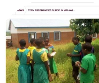
TEEN PREGNANCIES SURGE IN MALAWI

A 17-year-old girl from the Phalombe district, who asked not to be named, said she became hopeless when the government closed schools.